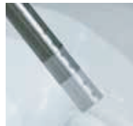
Massage & Move