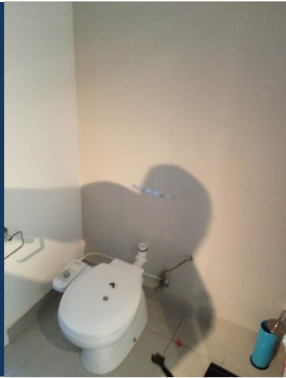
2. Remove existing toilet