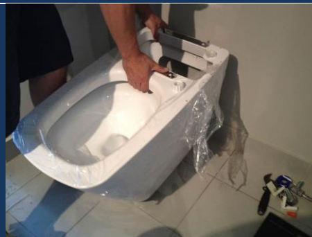
8. Place pan over the flex drain connection