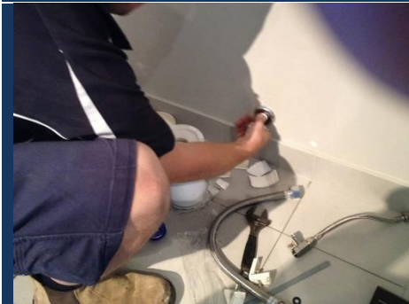
4. Replace water valve