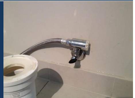
6. Install t-piece and hose