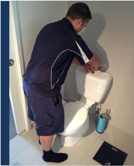
1. Remove cistern