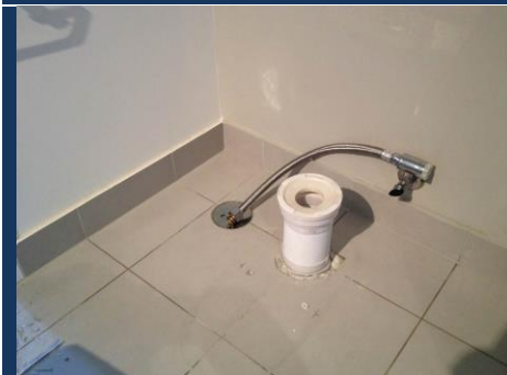
7. Clean and prepare area