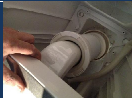
9. Insert s-trap into flex drain connection