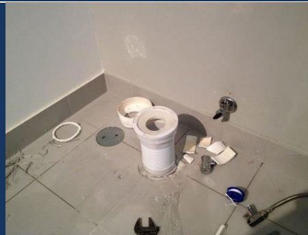
5. Install flex outlet