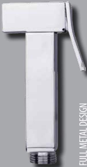
FULL METAL DESIGN