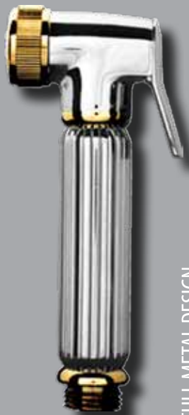
FULL METAL DESIGN

INCLUDES: 1x Handspray, High pressure 1500kpa hose, Holder, Screw, Dual Check Back Flow, Water Diverter, Braided Hose, pressure reducing valve